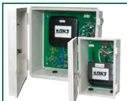
voice & data and voice only models