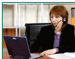
turnkey easy programming from your computer with supplied DKS software