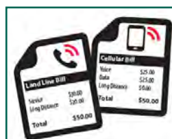
service plans no long distance fees